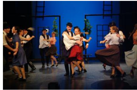
Szegedi Open-Air Festival