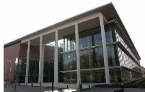
University of Szeged, Study and Information Centre

The Centre has a Congress Room with a seating capacity of 700 persons, several lecture rooms, a huge exhibition room and a video conference room which make it highly suitable for hosting various conferences. The University Library is also to be found in the building of the Study and Information Centre. Our students and teachers can select from a book collection of 350.000 items stored on open shelves and from book holdings consisting of 1.5 million volumes and periodicals to be found in traditional stacks. It has over a thousand books specially selected for international students. Our library is the largest and most significant collection of the town and the region, and one of the most important scientific collections in the country.